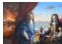
Rita Greer- History Painter

To use chalk pastels in order to create a piece of artwork inspired by Rita Greer.