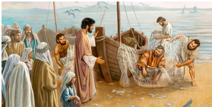
Jesus Calls His Disciples (Matthew 4:18-22; Mark 1:16-34; Luke 5:1-11)

"Come follow me ... I will make you fishers of men."