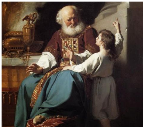
Old Testament Scripture The call of Samuel (1 Samuel 3: 1-10)

"Speak Lord, for Your servant is listening."